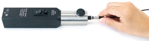
Figure 6 Calibrating hydrophone with pistonphone

After the measurement, data is downloaded to a PC where it is automatically post-processed. Sample results are shown in Table 2.