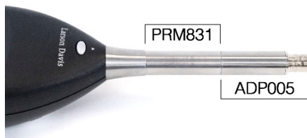
Figure 3 Sound Level Meter with preamplifier and hydrophone adapter