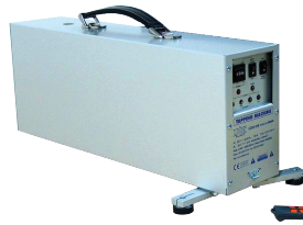
BAS004 Tapping Machine