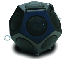
BAS001 Omnidirectional Source