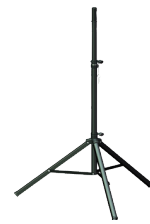
TRP023 Heavy Duty Tripod