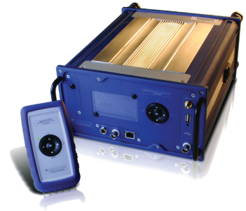
BAS002E/U Lightweight Power Amplifier