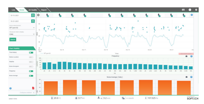
Daily average noise reports