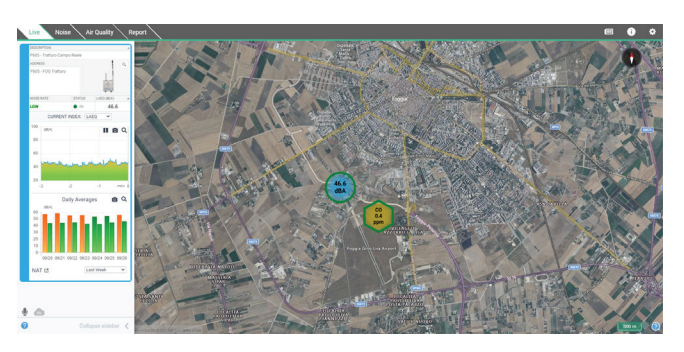
Public access to map-based noise information