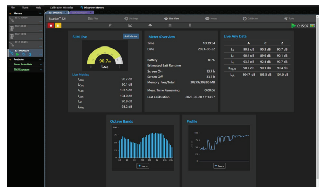
Live Sound Measurement View