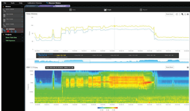
Time History Graph with optional 1/3 Octave Band data